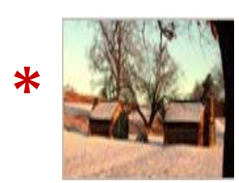
Valley Forge National Historical Park 1400 North Outer Line Drive King of Prussia, PA 19406 Park grounds 7:00 AM to dark Visitor Center 9:00-5:00 PM daily

Valley Forge was the site of the 1777-78 winter encampment of the Continental Army. The park commemorates the sacrifices and perseverance of the Revolutionary War generation and honors the ability of citizens to pull together and overcome adversity during extraordinary times.